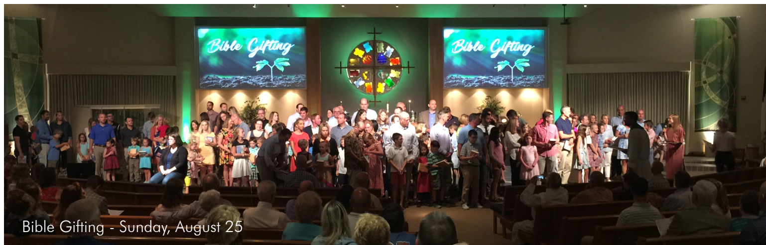
Bible Gifting - Sunday, August 25